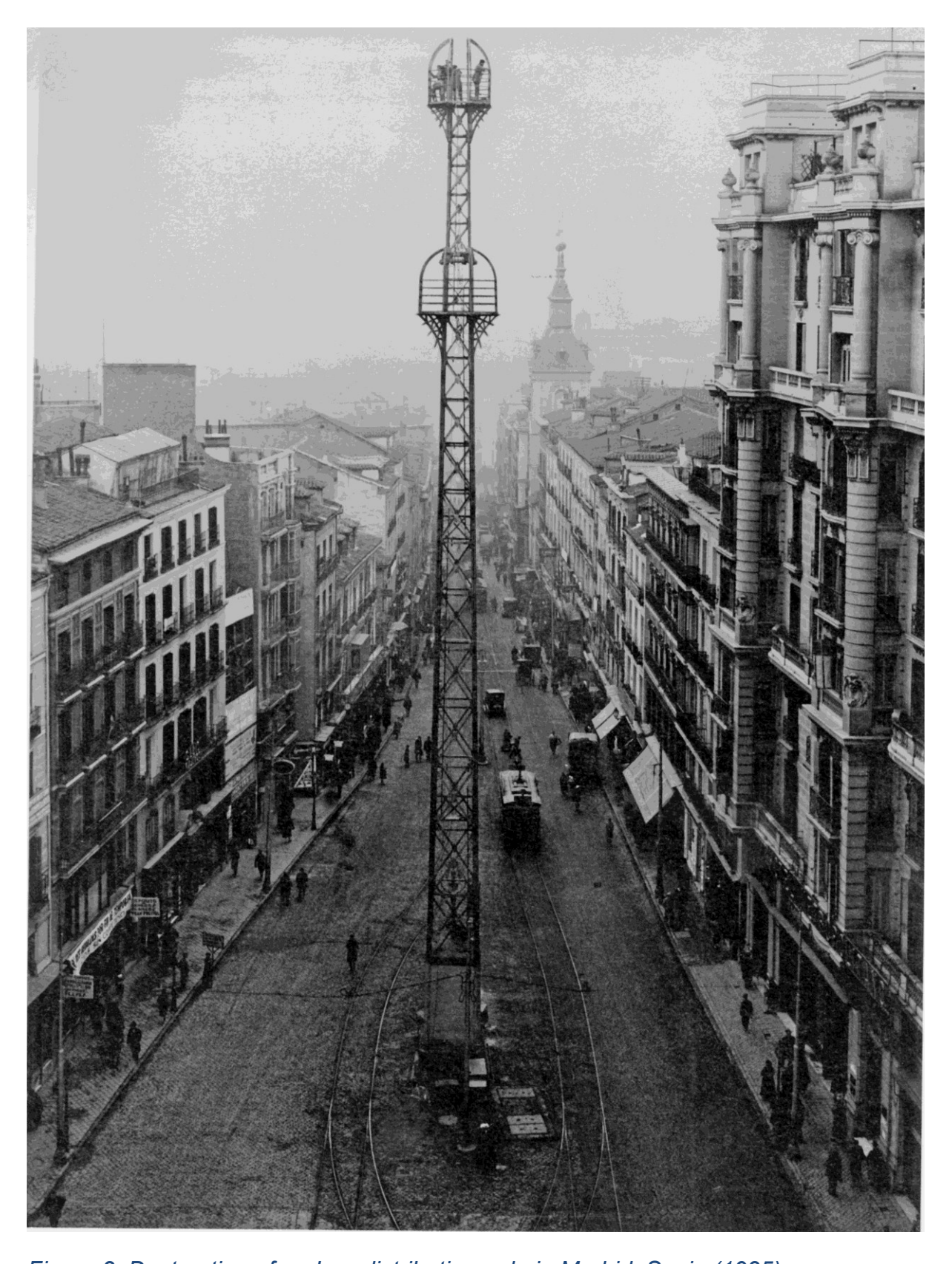
Figure 2: Destruction of an Iron distribution pole in Madrid, Spain (1925)