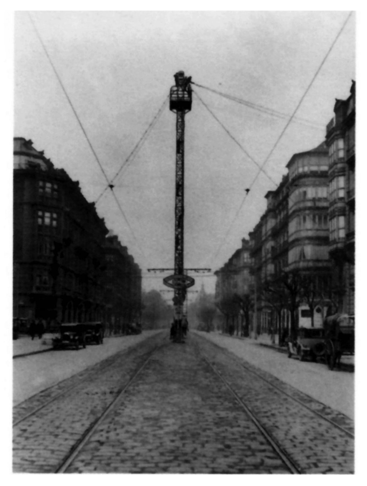
Figure 4: Iron distribution pole in Bilbao, Spain (1928)