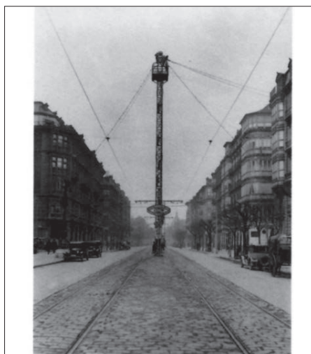
Anónimo, 1928 Torre metálica, Bilbao Archivo de Telefónica