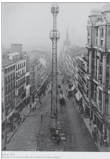
Fig. 2 - Destruction of an iron distribution pole in Madrid, Spain (1925)

In the November 2021 issue of Singing Wires , I wrote the article "History of Telephony and Wiring Through Old Postcards." It described a method of bringing telephone wiring from the exchange to the subscribers' homes by using derricks and tall distribution poles. To our knowledge, this system was only used in Belgium and the Netherlands in the early decades of the 20th century.