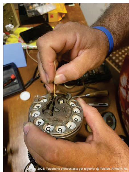
Fig. 4 - Dial Repair Workshop

Before “corona time” we had a get together in Steenhuffel, Belgium with a lot of people interested in the history of telephony (see report in the THG Journal winter 2019-2020, or Singing Wires of April 2020).