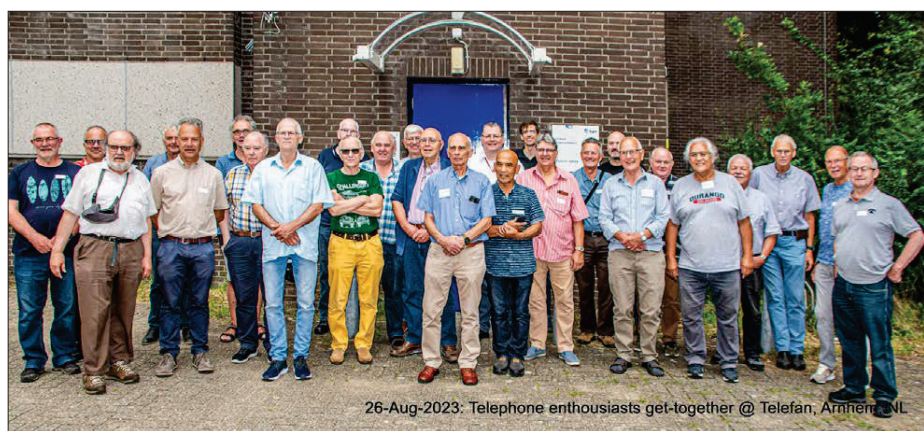
Fig. 3 - A group picture at Telefon, Arnhem, NL