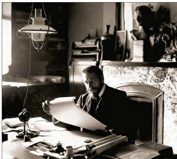
Fig. 2 - Art Nouveau architect Victor Horta with a Vande Meerssche telephone (1905)

The Fig. 2 picture was taken at the desk of his Brussels office.