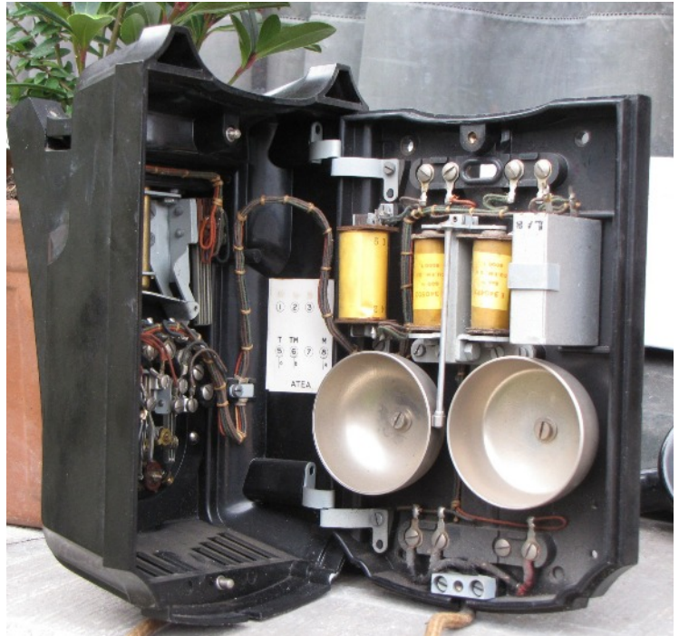
It can be opened for service without dismounting