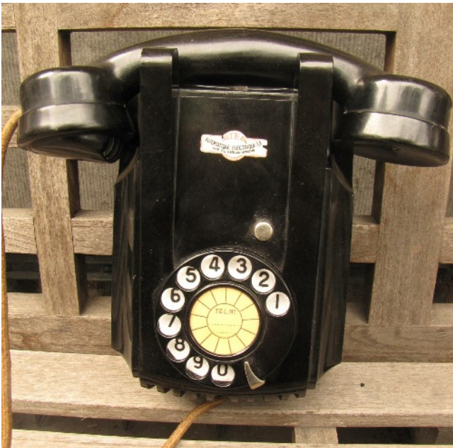
Front view of the Type 51

We do find the phone in the ATEA catalogue with the original name "Telephones" of May 1, 1940. It has been manufactured for sure until the mid 1950s, probably even later.