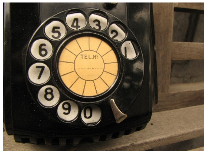
ATEA type dial