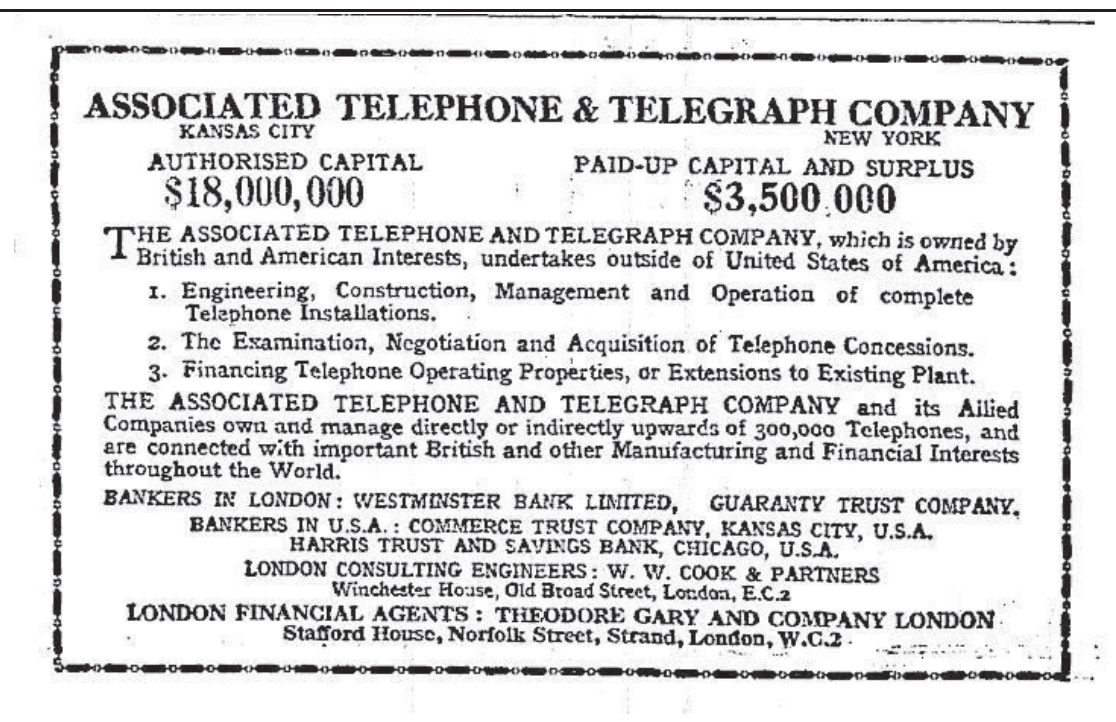
Figure 2: Advertisement of the Associated Telephone and Telegraph company, 1927